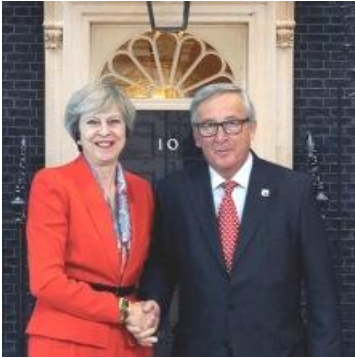
VICHY BRITAIN? May hands Juncker the keys to No 10 until 31 December 2020?

Machiavelli wrote that nothing met more opposition than change over to a new order. On the morning after the referendum, the BBC had lined up 'Bregrets' – stories from those who allegedly regretted voting Leave.