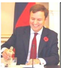
Former Osborne aide and Remain campaigner Greg Hands MP at least promptly accepted the referendum result. Now a trade minister under pro-Brexit Liam Fox.

! After December's deal was agreed, May's Chief of Staff, Gavin Barwell, tweeted that Remainers should be “reassured”.